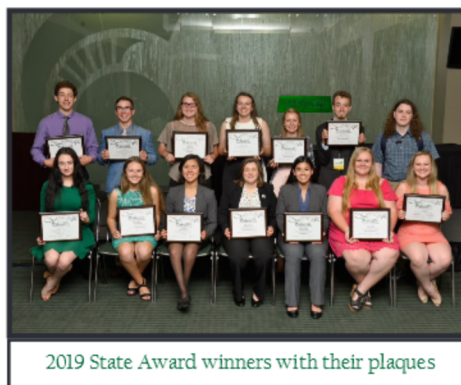
2019 State Award winners with their plaques

Michigan 4-H true leaders ages 11 and older have an opportunity to be recognized for the great work they do in 4-H by completing a state award application. A Michigan 4-H State Award is the highest honor bestowed on a Michigan 4-H member and provides an opportunity to receive recognition for their engagement in rich learning experiences that result in outstanding knowledge and life-skill development.